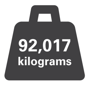
OF FOOD RESCUED